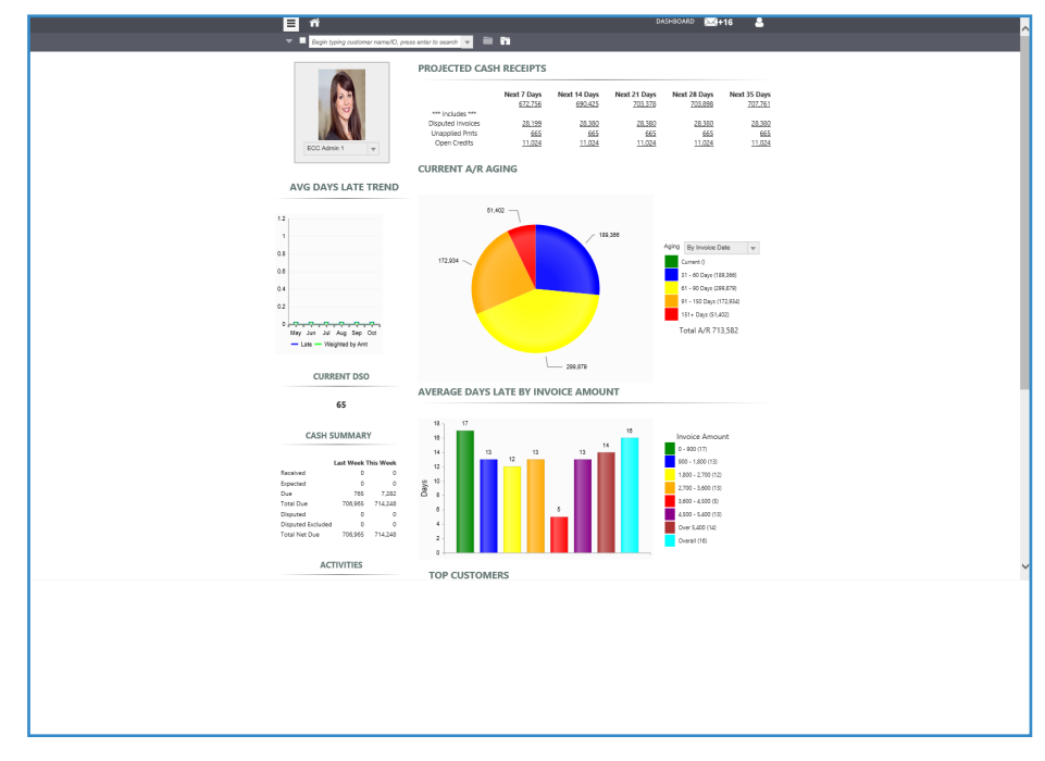
Figure 10.1 Credit and Collections—Improve cash flow and reduce receivables balances.

CRE combined with the Epicor Payment Gateway stores all of the credit card data encrypted securely in the cloud, therefore the Payment Card Industry Data Security Standard (PCI DSS) scope for Epicor ERP users is reduced.